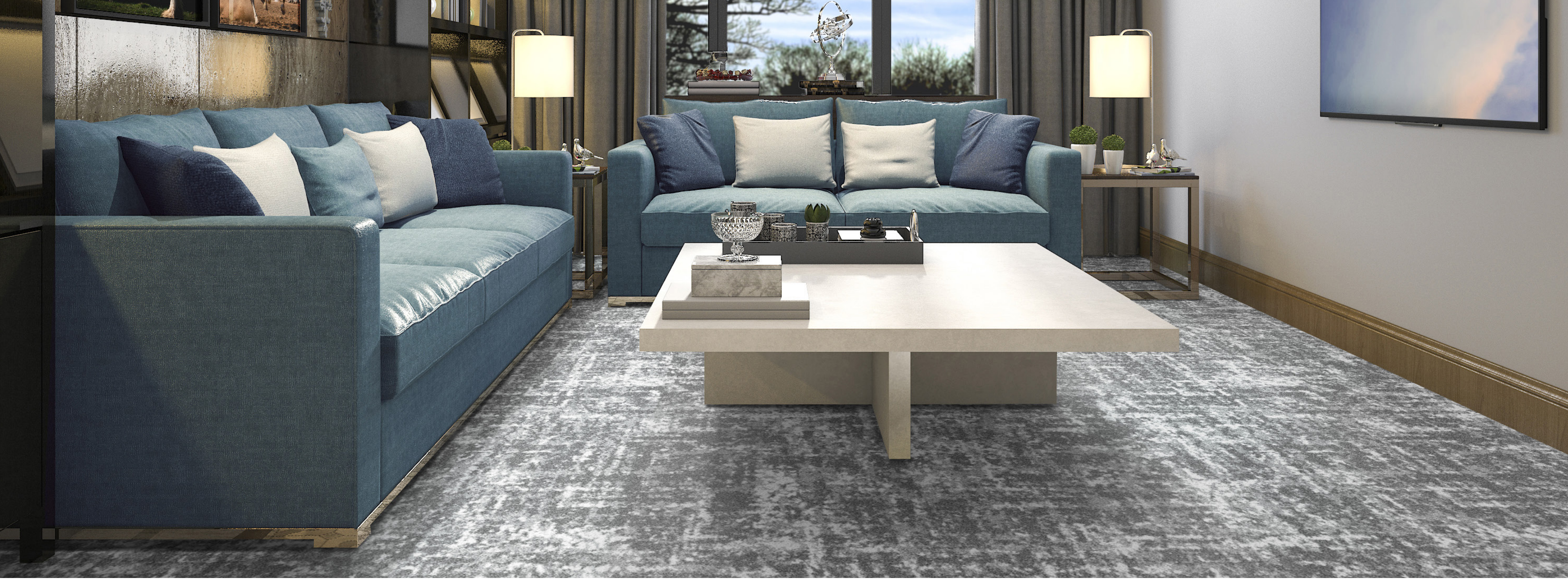
Stretched Thin in Cloudy / 54" x 54" / Available in 26 oz / 13'6"